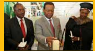
SELUBE NEZITHELO UHLELO LOKULETHA UXOLO EMIPHAKATHINI Ikhasi 3