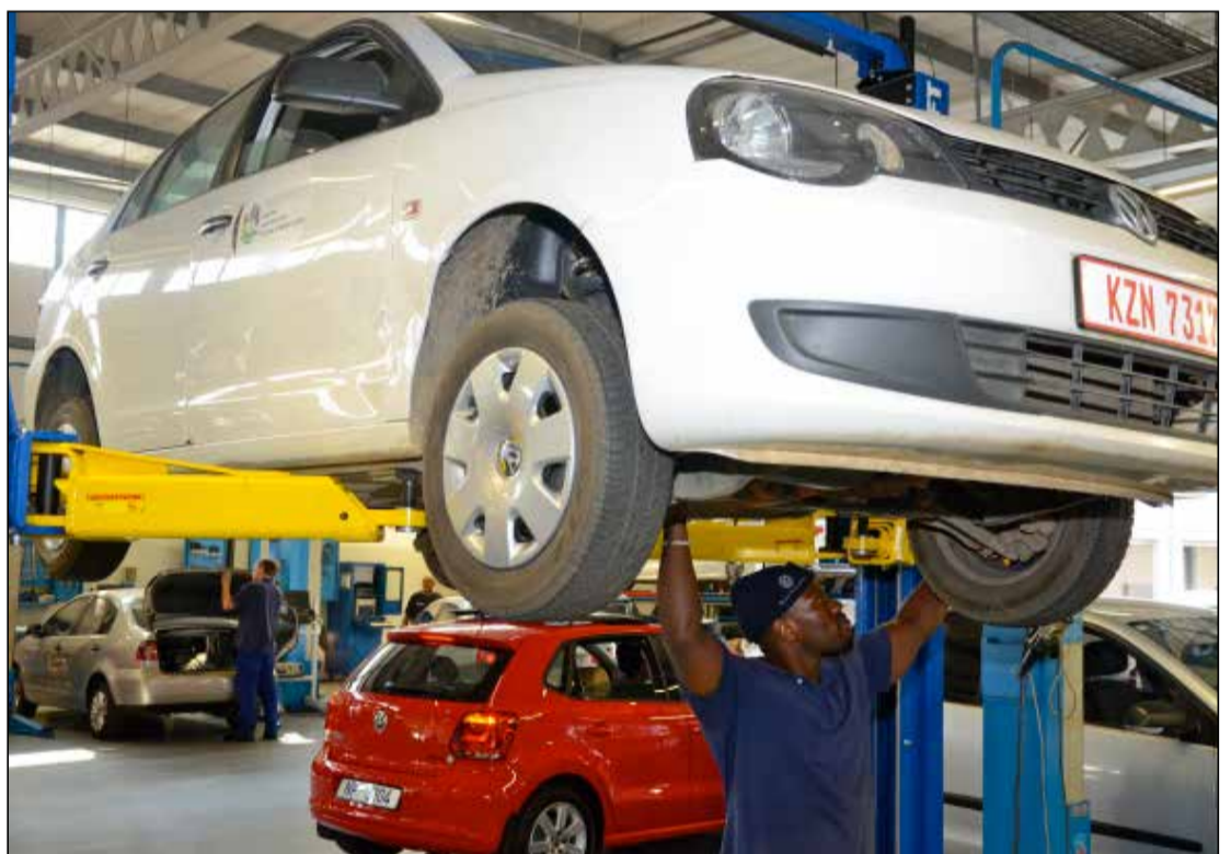
UKUBAMBA iqhaza emkhankasweni wokulwa nezingozi emigwaqeni, uMnyango uhlabe ikhwelo eminyangweni kaHulumeni eyahlukene ukuba iqinisekise ukuthi izimoto nabashayeli bazo basesimweni sokuba semgwaqeni.

“Wonke umuntu uneqhaza okumele alibambe ukuze kuliwe nalesi sihlava esihlasele emigwaqeni yethu. Ukuphepha emgwaqeni kusengezinye zezinto