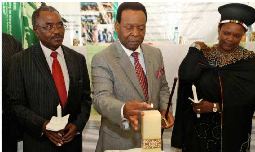
SILO samaBandla, uNdlunkulu waseMatheni noNgqongqoshe uMchunu, kubungazwa ukuthula eMatheni.