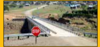
UMCHUNU WETHULE U-R6.9 BILLION WOKWAKHA IMIGWAQO NAMABHRIJI Ikhasi 2