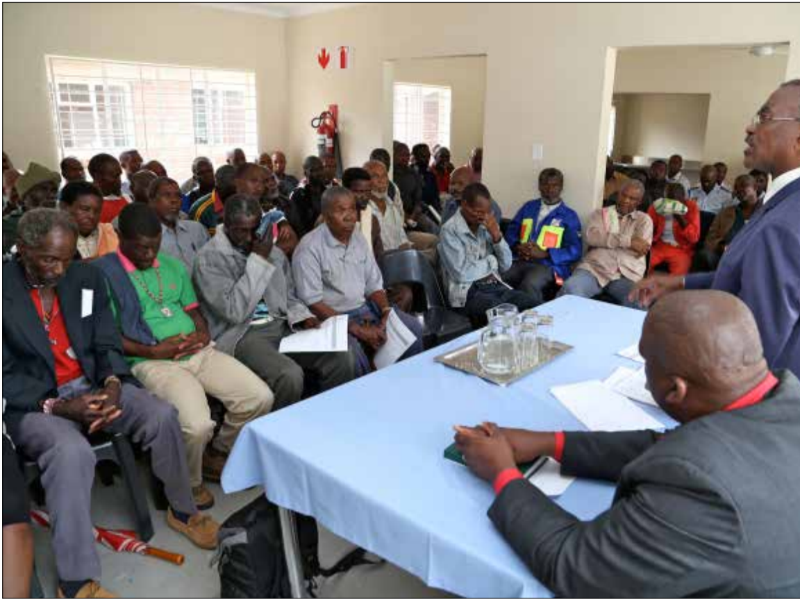
UMCHUNU kweminye yemihlangano yomphakathi emizamweni kaHulumeni yokungenelela ekulweni nobugebengu obuhlasele izakhamizi zakuleli.