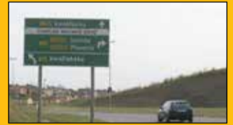
KUZOQOPHEKA UMLANDI KUQANJWA NGAMAQHAWWE IMIGWAQO YESIFUNDAZWE Ikhasi 4